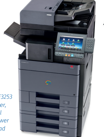
d-Color MF2553 / d-Color MF3253 with DF-7100 Internal Finisher, DP-7110 Single-pass Original Feeder, PF-7100 Double Drawer and NK-7100 Numeric Keypad